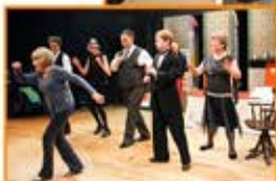
Images from various Green Room activities during the 2018-19 season